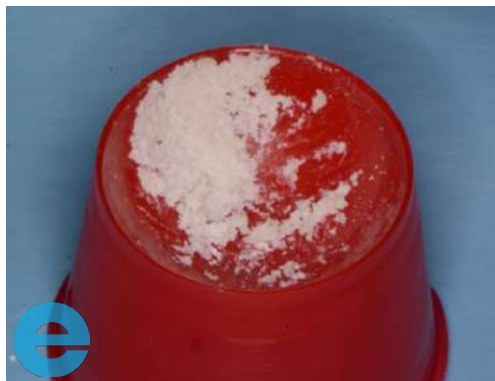
7. EthOss bone grafting material placed on container