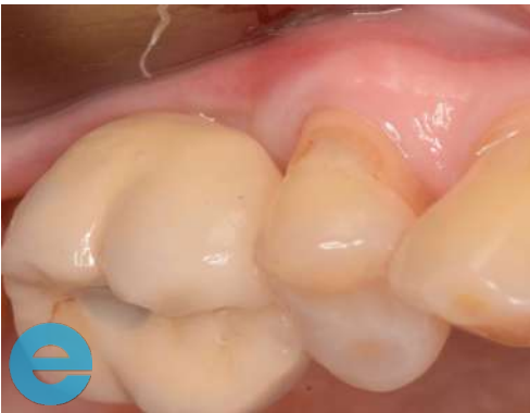
15. Loaded 4 months - everything very stable