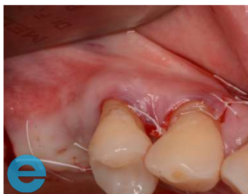
10. Sutured closed with PTFE (Coreflon)