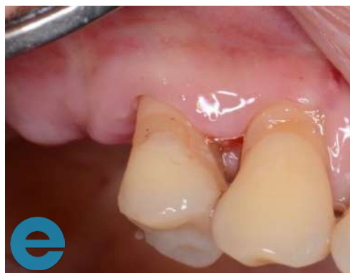
12. Healing by secondary intention