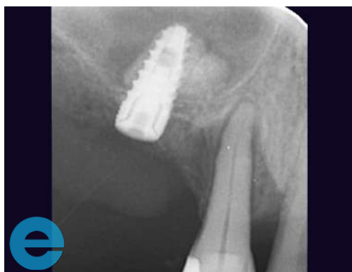
9. Radiograph of 15 with implant and EthOss bone grafting material