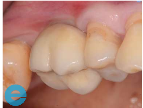
14. Loading at 3 months, bone around 15 now very solid and patient happy