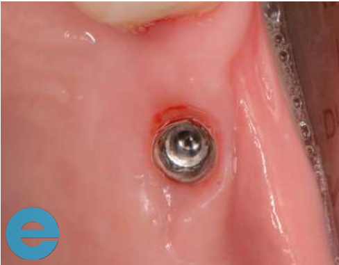
13. Loading at 3 months, bone around 15 now very solid and patient