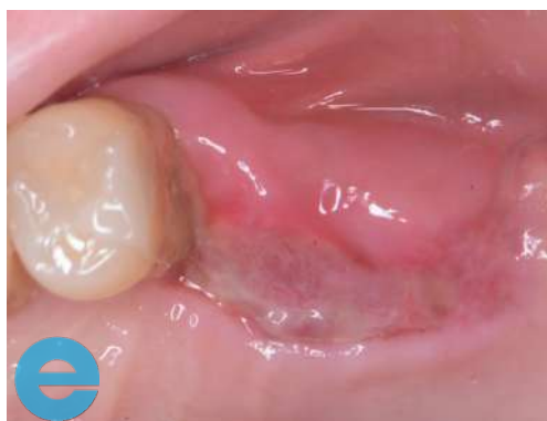
11. Sutures removed at 5 days, shows healing by secondary intention