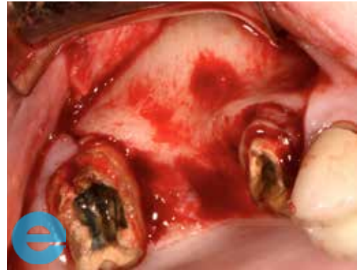
2. Site exposed.