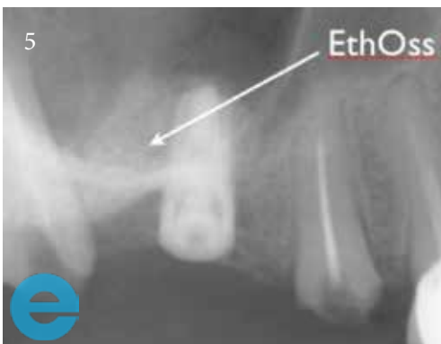
5. Initial radiograph.