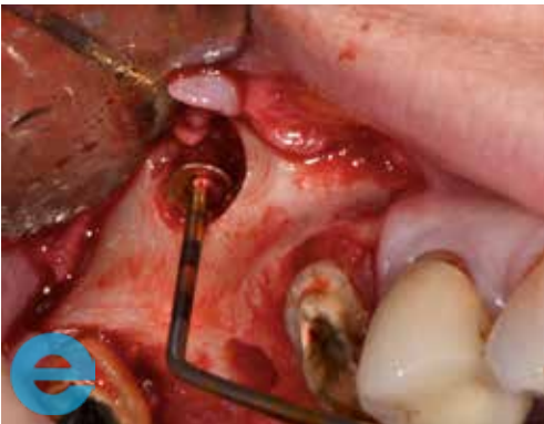
3. Lateral window using DASK system.