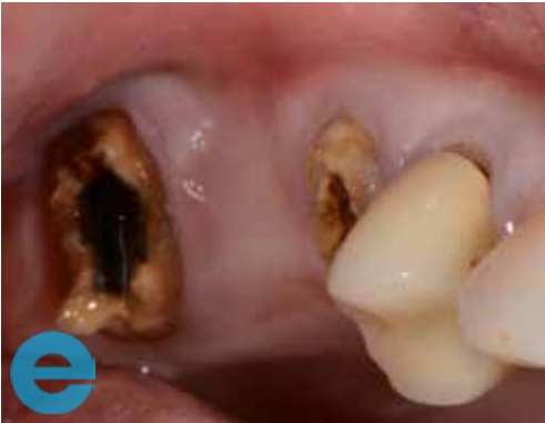
1. Original site.