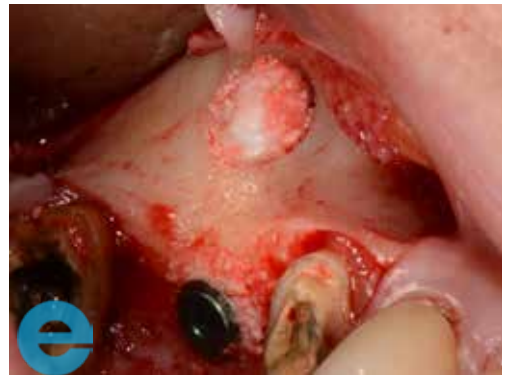
4. Implant placed, window sealed with EthOss®.