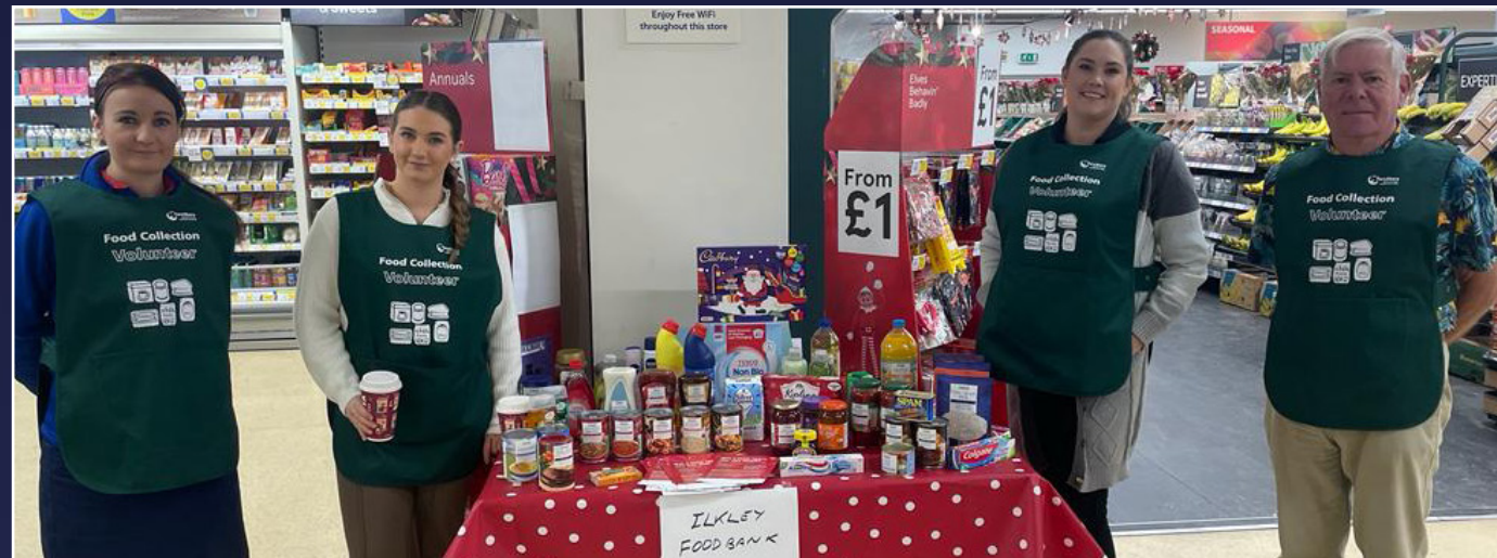
The EthOss team took part in the 2023 FareShare Tesco Winter Food Collection campaign