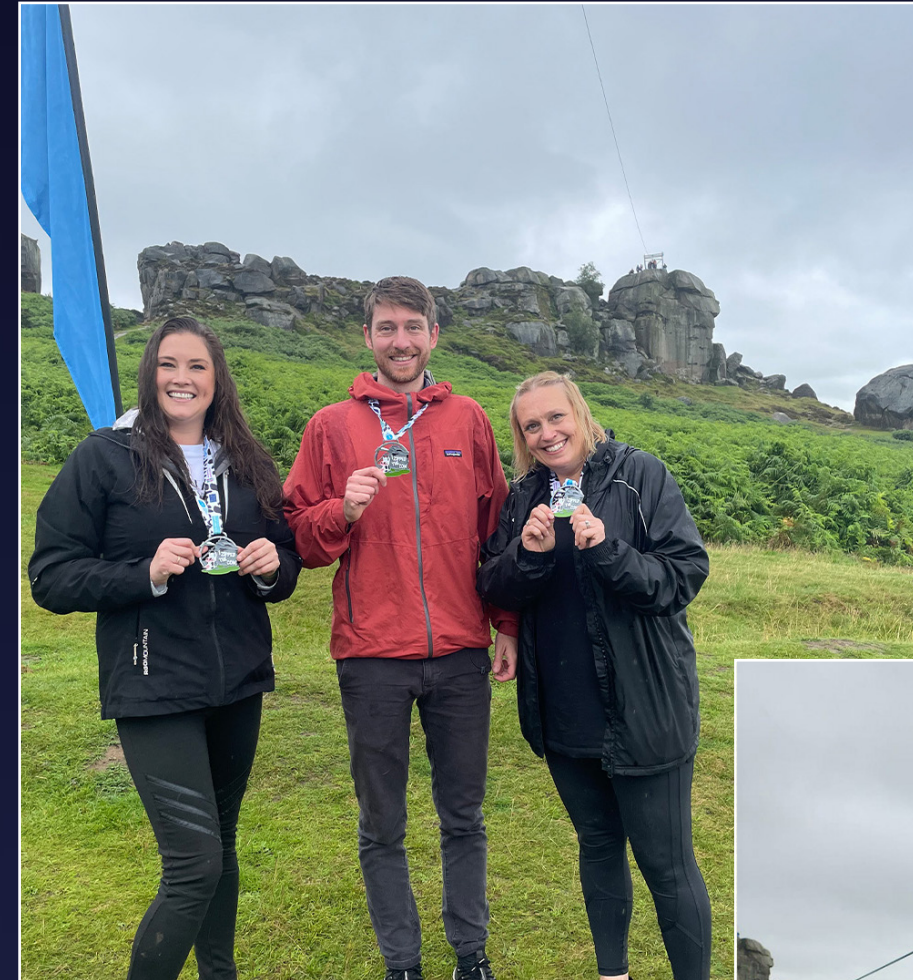
We participated in the Zip the Cow Challenge to support the local charity, Sue Ryder. EthOss raised an impressive £2,215, the highest amount collected for the event